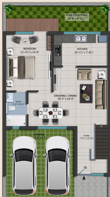
GROUND FLOOR PLAN - COVERED AREA 81.784 SQM (74.76%)