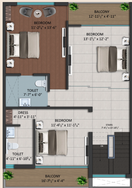
FIRST FLOOR PLAN - COVERED AREA 86.148 SQM