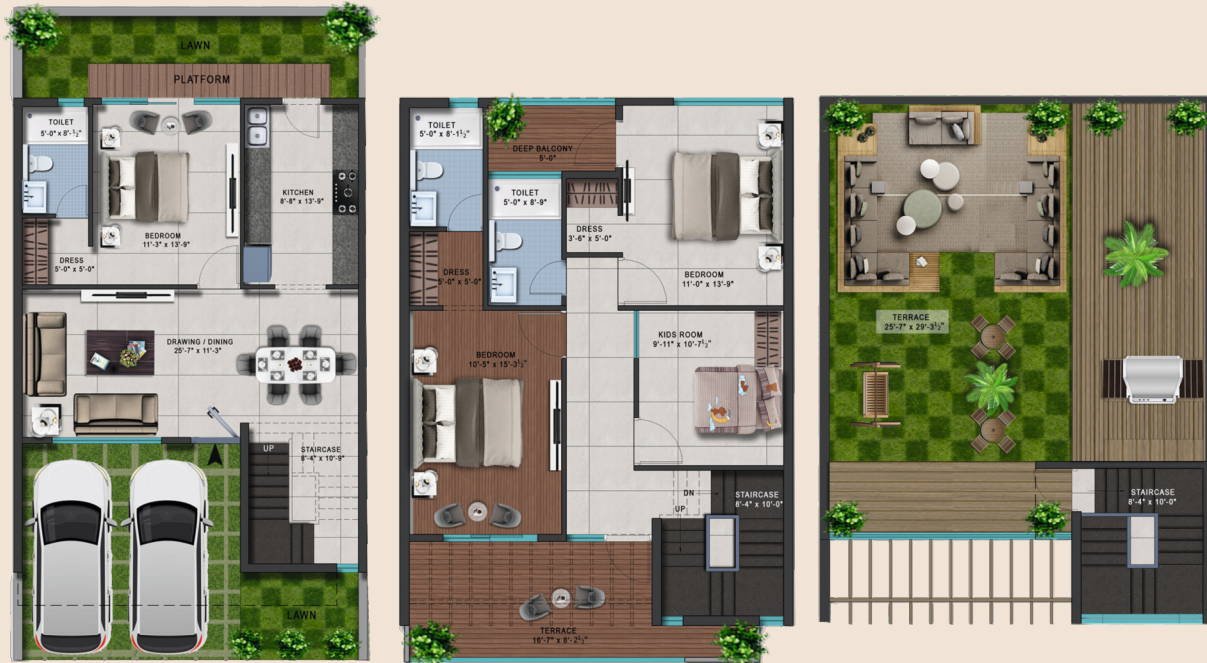
GROUND FLOOR PLAN - COVERED AREA 94.478 SQM