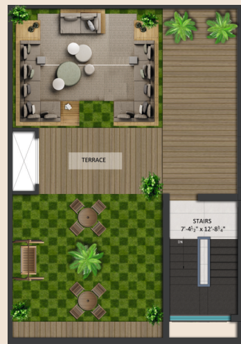
TERRACE GARDEN - COVERED AREA 10.454 SQM