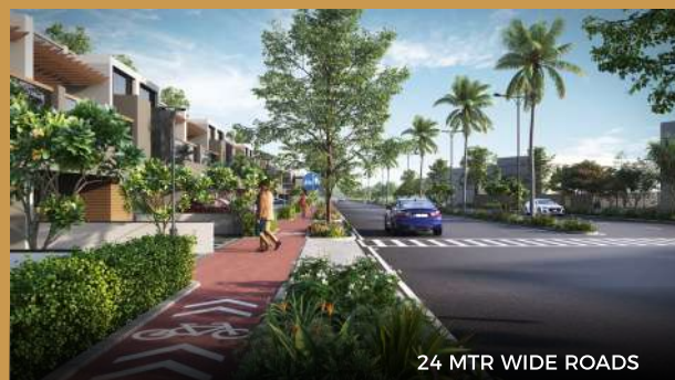
24 MTR WIDE ROADS